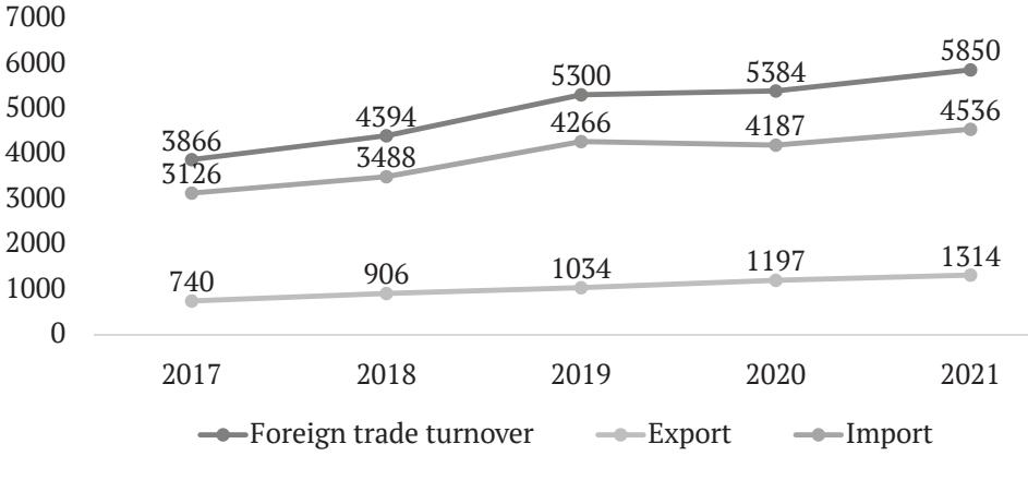
Fig. 1. Dynamics of trade and economic cooperation between China and Belarus in 2017–2021, USD m.

In 2021, Belarus exported goods and services to China for a total of 1,314 million USD. It is also more than in 2020 (1,197 million USD). The dynamics are quite positive, with exports increasing even during the pandemic. The majority of goods exported by Belarus to China are potassium fertilisers, frozen beef, timber, offal, condensed and dried milk and cream, woodwork, sodium and sulphate cellulose, whey, sugar, rapeseed oil, and integrated circuits.